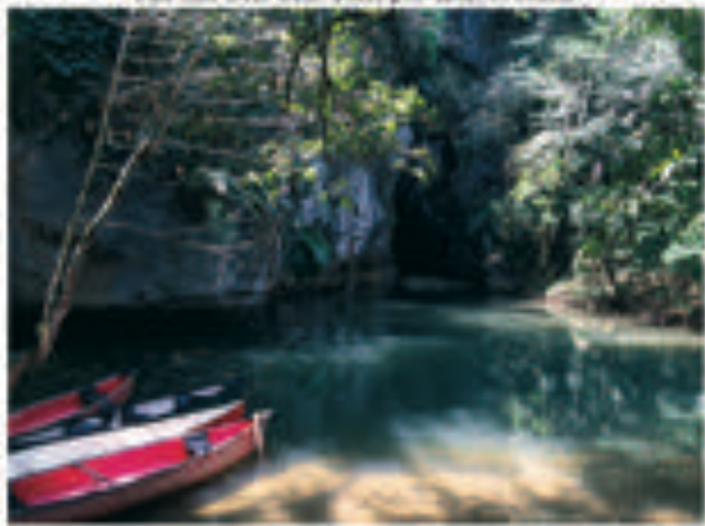
This is the entrance to the answer caves where the Mayans used to stow away all sorts of things in hopes of survival. The caves are 7 miles long and filled with the most incredible stalagmites and stalactites. A 45-minute trip away from Gaia, arranged by the hotel.