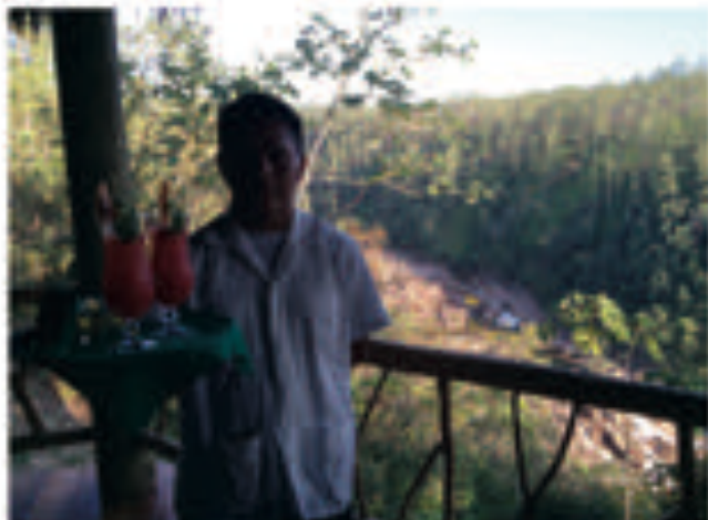
The welcome drink, a fresh fruit concoction with an optional serving of delicious rum, served by a happy Belizian chef.