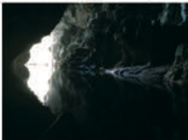
A little more cave action.

GAIA RIVERLODGE FEATURED ON AHOTELLIFE.COM MARCH 2014