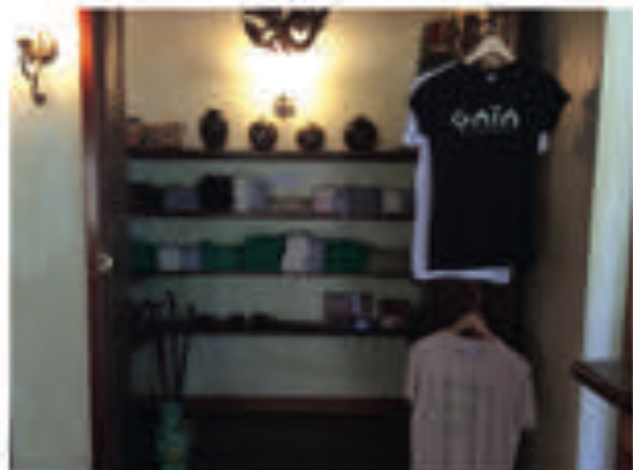
The room at Gaia. Local Belizian crafts, t-shirts and coffee!