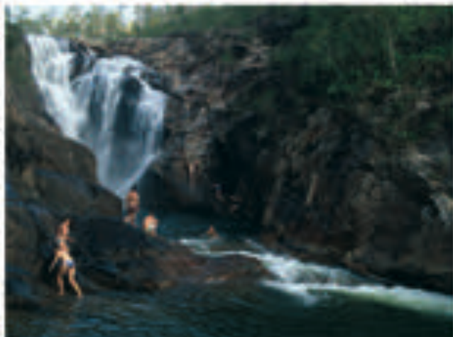
I felt like I was in a Ryan Murphy photo... but with clothes on. Big Rock Waterfall at sunset is perfect, and just a short 10-minute bike ride from Gaia. Bikes provided, of course.