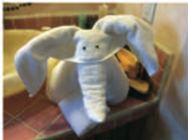
Bat in... loved it.