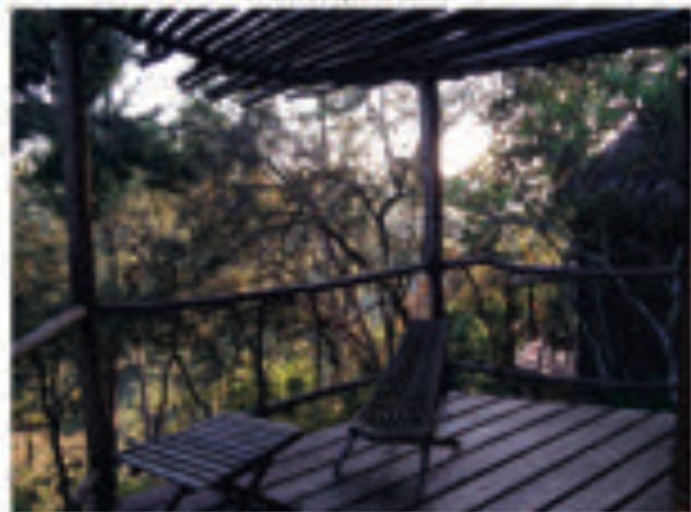
The balcony high in the trees, overlooking the incredible valley.