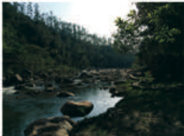
The view at Big Rock. I mean...