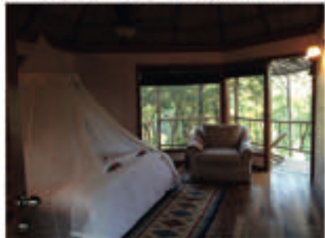
The accommodations. Simple, clean jungle living.