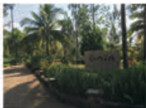
Believe in Gaia Riverlodge - The jungle never sleeps

TYPE: ADVENTURE ROOMS: 200 BAR: Adventure