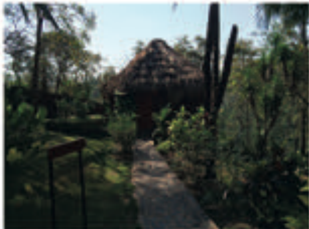
Here for a couple of nights. 13 bungalows in total, spread out over a couple of acres.