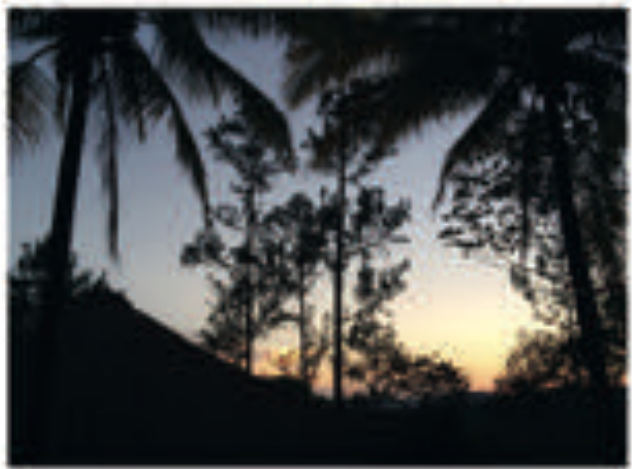
The views presented over the mountains are incredible. The photos do it no justice!

GAÏA RIVERLODGE FEATURED ON AHOTELLIFE.COM MARCH 2014 | PROVIDED BY ZOF AGENCY